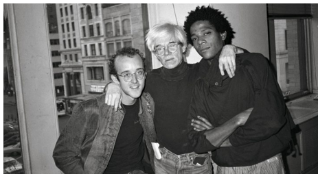
Keith Haring, Andy Warhol and Jean Michel Basquiat at Andy's studio at 860 Broadway

Masterworks agreed to acquire The Mosque (1982) at Christie's Evening sale of Post-War and Contemporary Art in London on February 12, 2020. The canvas, which was completed the same year as his auction record that sold for $110.5 million in May 2017, remains on its original stretcher of tied wood crossbars—one of the artist's great innovations.