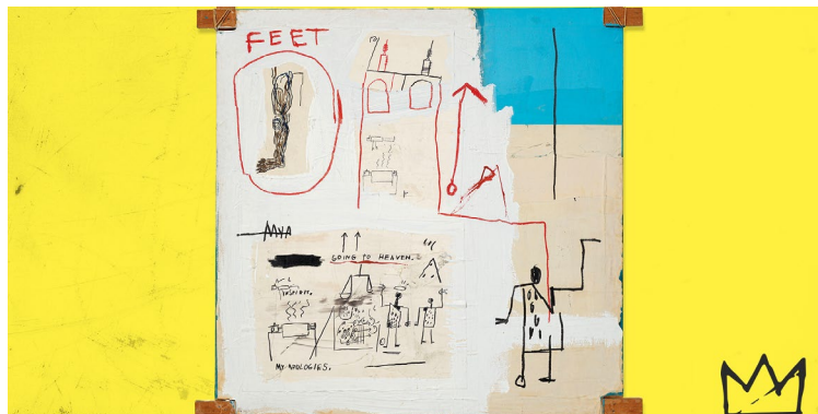
Jean-Michel Basquiat BLUE-CHIP THE MOSQUE · 1982

This poetic and autobiographical work by Jean-Michel Basquiat is a truly unique and captivating painting created in the most important year of his brief career.