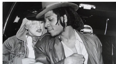
Jean-Michel Basquiat and Madonna on the road to a New-Yorker party in 1983

FOR A COPY OF THE OFFERING CIRCULAR VISIT: